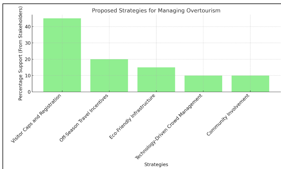
Fig. 3: Proposed Strategies for Managing Overtourism

The proposed strategies focus on sustainable tourism practices that balance environmental preservation, socio-cultural integrity, and infrastructural resilience while enhancing the pilgrimage experience. These strategies are categorized into five main areas: visitor management, environmental conservation, community engagement, infrastructure development, and technology integration.